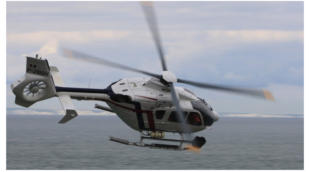
Human safety and environmental hazards can quickly escalate in offshore production with unwarranted trips to and from site. Gaining remote visibility to these sites is exceptional to delivering strong sustainable, return.

Once Enovate Ai had a crystal clear vision of what was already in use, what was needed, and what was not needed, they worked with Emerson