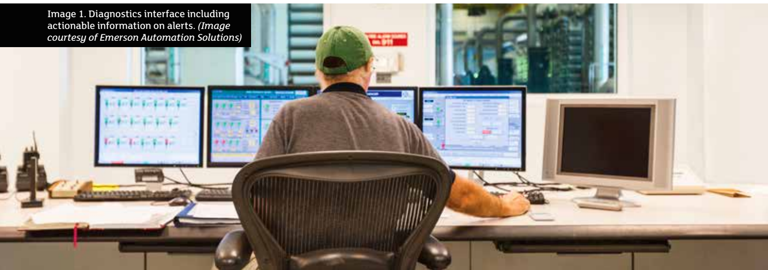
Image 1. Diagnostics interface including actionable information on alerts.

Yet, Coriolis meters can be vulnerable. In instances such as moisture-causing electrical issues, corrosion,