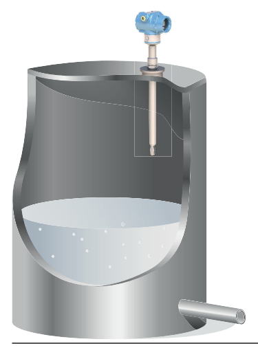
Figure 1-1: Example Application Overfill Protection

The level switch indicates, by means of an electronic output, whether the level of a process liquid is above, or below, a certain point (the switching point).