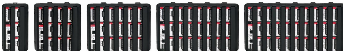
ROC827L (with 0, 1, 2, 3, and 4 expansion I/O backplanes)

The Polycarbonate/Acrylonitrile Butadiene Styrene (PC/ABS) plastic housing has removable wire channel covers to protect the wiring terminals. DIN rail mounting allows the ROC800L to mount on an enclosure backplane. The rugged housing is suitable for use over the complete extended temperature range.