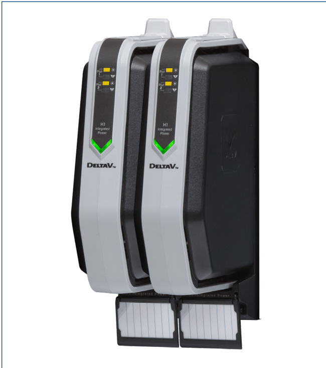
Redundant S-series H1 interface with integrated power.

Segment power supplies are integrated into this H1 card, greatly simplifying installation design, reducing footprint and improving segment diagnostics. The terminal block includes a fixed segment terminator, eliminating external wiring to fieldbus power supplies and their terminators. Redundant H1 cards provide redundant power to the segments for increased availability.