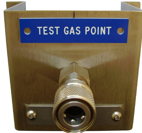
Diagram 2 - Gas delivery system with single point unit