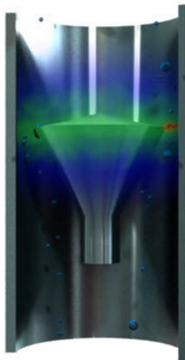
Figure 1: Cone Signal Field

In the Roxar SWGM, the water fraction measurement is obtained by microwave resonance, measuring the dielectric and real permittivity properties of the fluid with low uncertainty and very high sensitivity. Flow measurements are obtained by redundant differential pressure (DP) measurement over a cone. The cone and meter body form a resonant cavity for microwaves which is sensitive to the flow permittivity. At resonance, the microwaves propagate throughout the cross-section of the pipe. Therefore, the meter is sensitive to changes in the flow, independent of the type of flow. The permittivity of the flow is a function of fluid fractions, temperature, and water conductivity.