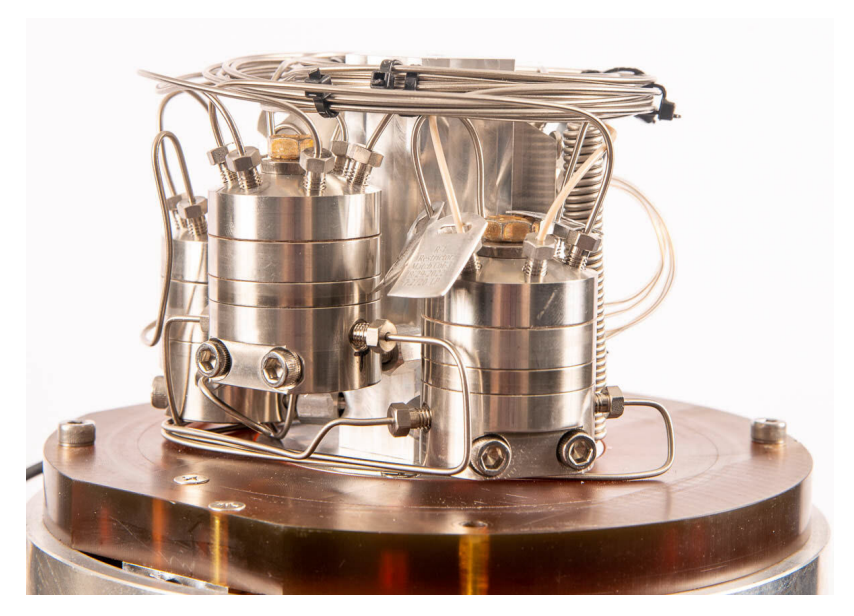
Figure 1: Rosemount 470XA Maintainable Module