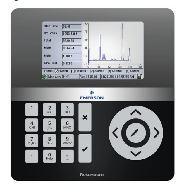
Figure 2: Rosemount 470XA LOI

Most GC routine maintenance functions can be directly performed from the LOI. In most cases, the GC can be installed, configured, and placed online without using a computer.