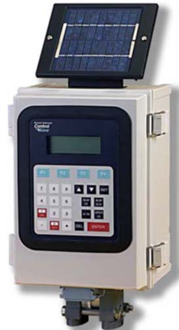
ControlWave Intrinsicly Safe Gas Flow Computer

The GFC-IS has two built-in RS-232 communication ports and one RS-485 port. One RS-232 port (Com 1) is factory wired to the LOI port of the bottom of the GFC-IS enclosure.