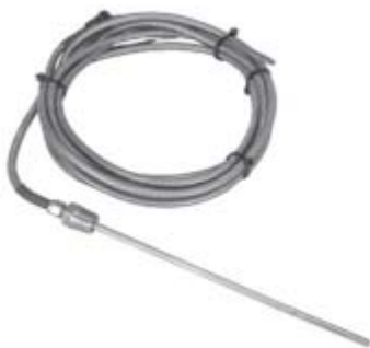
Bendable RTD with 12" probe

The RTD would normally provide the process temperature input but the standard application program also allows you to alternately select an external temperature transmitter.