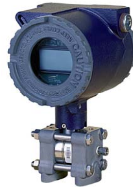
ControlWave XFC comes in a compact explosion-proof package (shown with DP/P sensor assembly).