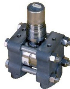
DP/P Multivariable Sensor Assembly

Using the integral sensor assembly is the easiest implementation for a single meter run; however, the standard application program also allows use of external transmitters.