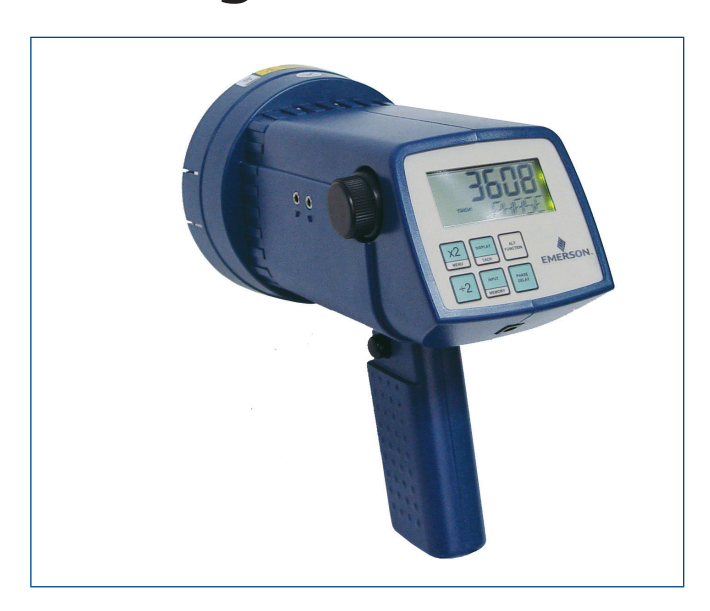
The AMS 555 Vibration Strobe Light provides accurate phase analysis results.