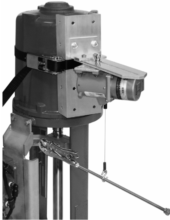
Figure 1. PIST Mounting Kit