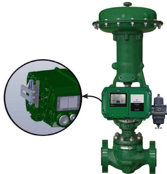
Figure 1. Linkage-Less Non-Contact Feedback System