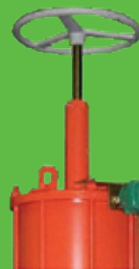
Mechanical Manual Override