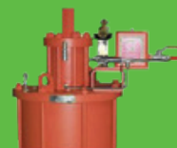
Hydraulic Manual Override