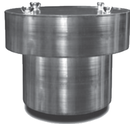
Figure 1. Model 8800 Vent Stack Flame Arrestor

Failure to correct trouble could result in a hazardous condition. Call a qualified service person to service the unit. Installation, operation and maintenance procedures performed by unqualified person may result in improper adjustment and unsafe operation. Either condition may result in equipment damage or personal injury. Only a qualified person shall install or service the vent stack flame arrestor.