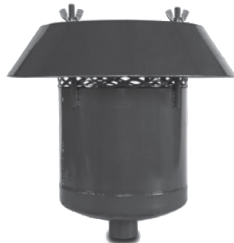
Figure 2. Model 9900 Vent Stack Flame Arrestor