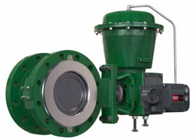
Fisher 8580 Valve Double Flanged Style