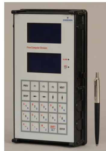
ROC800 Keypad Display

Security is provided by the ROC Keypad Display to control user access to information. Users are placed in "groups" having an assigned access level. Within each group, individuals can be assigned an additional level of access that overrides the group access level. Screens can be customized to allow users to view and edit parameters, view parameters only, or have no display access based on their group or individual access level. Typically, group or individual access is assigned based on job function. Each user within a group assumes the group's access level. However, an individual user can be granted or denied access to a specific display screen based on their individual access level.