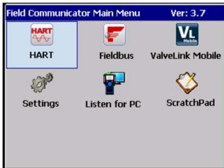
Figure 1. 475 Field Communicator Menu Screen