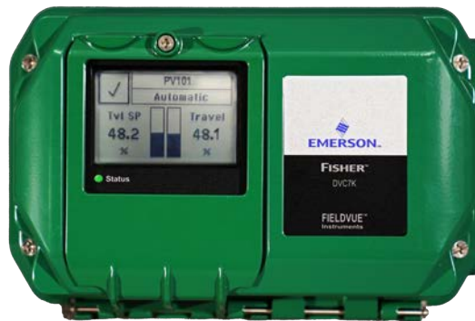
Figure 1. Fisher FIELDVUE DVC7K Digital Valve Controller

Manufacturer Name: Fisher Controls Physical Device Category: Valve Positioner Manufacture ID Code: 19 (13 Hex) Model Name(s): DVC7K [1312] HART Protocol Revision: 7.7 Device Type Code: 18 (12 Hex) Number of Device Variables: 10 Device Revision: 1 Physical Layers Supported: FSK