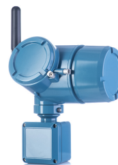
Rosemount 4392 Erosion Wireless Transmitter

The Rosemount 4392 Erosion Wireless Transmitter is an inline device designed to measure fluid erosivity in oil and gas flowlines using Roxar's multi-element sand probe. The Rosemount 4392 delivers data via WirelessHART ®, enabling secure and cost-effective data retrieval to desk, sharing wireless infrastructure with other devices.