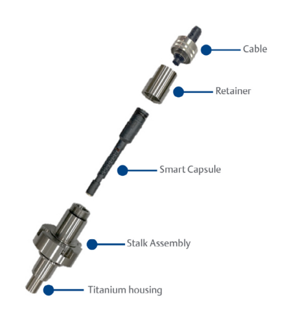
T-200 Series Gas Ultrasonic Transducer

All new Rosemount 3414, 3417 and 3418 gas ultrasonic meters will be equipped with the T-200 ultrasonic transducers. Consult your Emerson Flow representative for details.