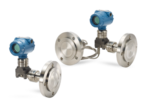
Rosemount 3051S for DP Level