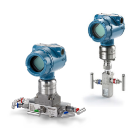
Rosemount 3051S Pressure Transmitters