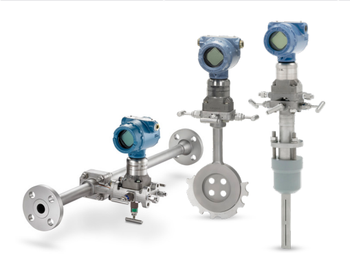
Rosemount 3051S for DP Flow