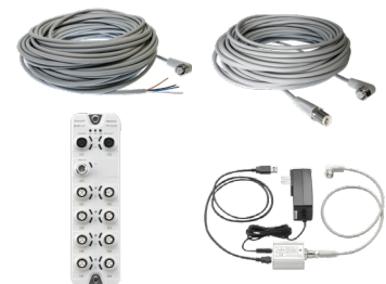
M12 cables and IO-Link accessories