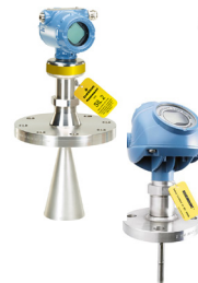
Rosemount 5408 and 5300 Non-Contacting Radar and Guided Wave Radar