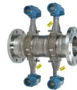
Rosemount 8880 Quad Vortex Flow Meter

Here are some of Emerson's IEC 61508 Safety-Certified Products