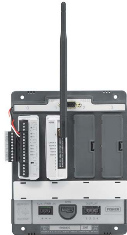
Distributed RTU Network Bundle (antenna not included)

The DRN Bundle is assembled in a four-slot FB107 chassis. The Distributed RTU Network CPU is installed in slot 0. You can install any FB107 communications or I/O module in slots 1 and 2. The NRM is a communications module and is installed in one of these slots. You can install any FB107 I/O module in slot 3. For more information on the 4-slot FB107 chassis and available modules, refer to Product Data Sheet FB107 .