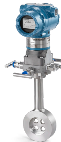
Rosemount 3051SFC Compact Orifice Flow Meter