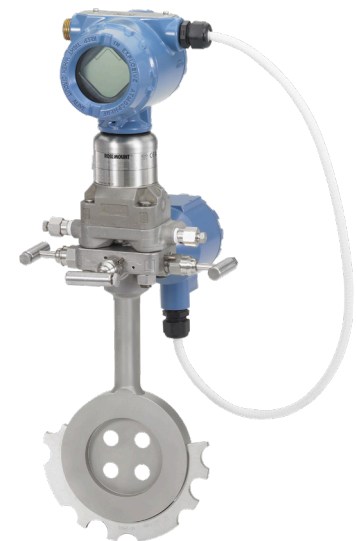
3051SFC Compact Conditioning Orifice Flow Meter