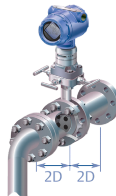
Comparison of required straight pipe lengths (Conditioning Orifice Plate vs. Traditional Orifice Plate)

When the difficulties and conditions were explained, the Emerson engineer was confident that he had the solution - the Rosemount 405C Conditioning Orifice Plate with 3051S Differential Pressure Transmitters.