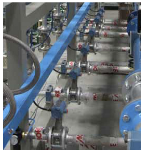
Installed Rosemount 8800 Vortex Flow Meters to control the injector feed of oxygen supply for a more accurate oxygen-fuel ratio.