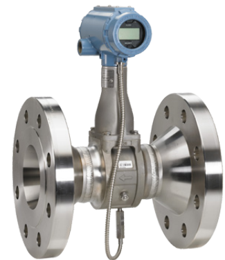
Rosemount 8800 Vortex Flow Meter