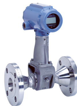
Rosemount 8800 Series Vortex Flow Meter

Lift costs were reduced with Rosemount Vortex on test separator gas measurement.