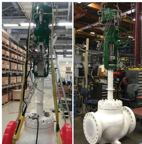
Fisher NPS 16 EWT-C JT control valve

Head of Instrumentation Department, LNG Plant