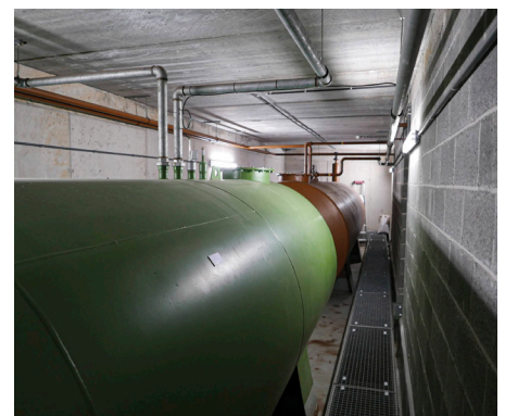
Image 1. Storage bullet tanks containing fuel for planes