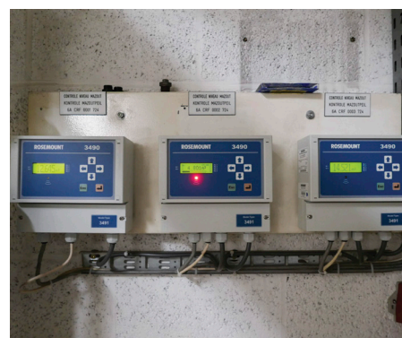
Image 3. Rosemount 3491 Controllers installed in the building and connected to the level measurement transmitters