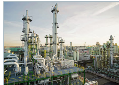
The oxo plants at the OQ Chemicals Ruhrchemie site

The test was successful but also showed potential for optimization: Because of the temperature dependency of the refraction of light and the temperature fluctuations when water and NPG are mixed, the temperature in the process must be measured precisely and the media data record must accurately reflect the relationship between temperature, refraction and concentration. After appropriate adjustments, PIOX® R measures in good agreement with the results of the titrations in the laboratory. OQ Chemicals therefore decided to buy.