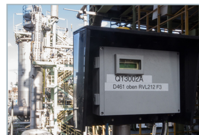
The PIOX® R704 measuring transmitter calculates the water content from the measured light refraction and feeds the measured values into the process control system.