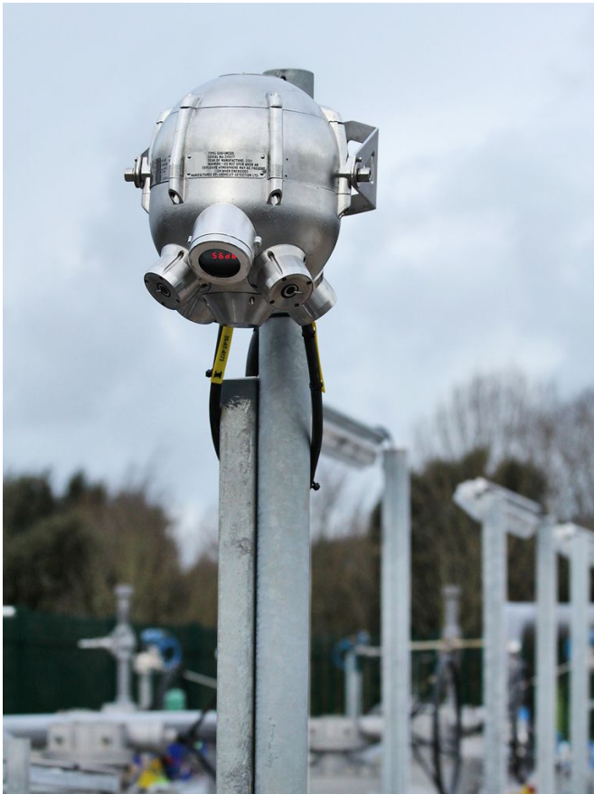
Figure 3: Ultrasonic gas detectors, such as Emerson's Incus Ultrasonic Gas Leak Detector, listen for the sound of escaping pressurized gas.

Where the target gas is in a pressurized system, it may be possible to use an acoustic sensor (Figure 3) tuned to the ultrasonic range to detect noise made by a leak in the system. Such leaks can make noise within these targeted frequencies, which can be used to warn of an escape before there is sufficient concentration to trip conventional sensors. On the other hand, acoustic gas leak detectors are suitable only for pressurized escapes and may cause a false trip due to an unrelated noise source.