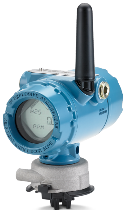
Figure 2: Electrochemical toxic gas sensors, such as the Rosemount™ 928 Wireless Gas Monitor, can be used to detect hydrogen sulfide by creating a reaction between the toxic gas and an internal catalyst.

A sensor identifies the target gas either because the gas reacts with something inside the sensor in a way that changes an electrical signal (electrochemical) (Figure 2), or the target gas absorbs specific wavelengths of infrared (IR) light. When the gas passes between an IR source and receiver, the change is measurable. IR point sensors may have only a centimeter or two between the two elements inside a single enclosure.