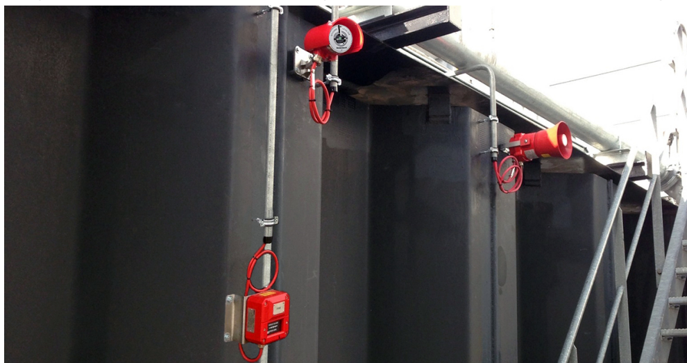
Figure 1: While a sensor may be the only visible part, fire and gas detection system logic can be quite complex.

Like basic process control and SIS, fire and gas systems use sensors tied to a controller (Figure 1) programmed to execute tasks to mitigate the hazard in response to detecting a specific condition.