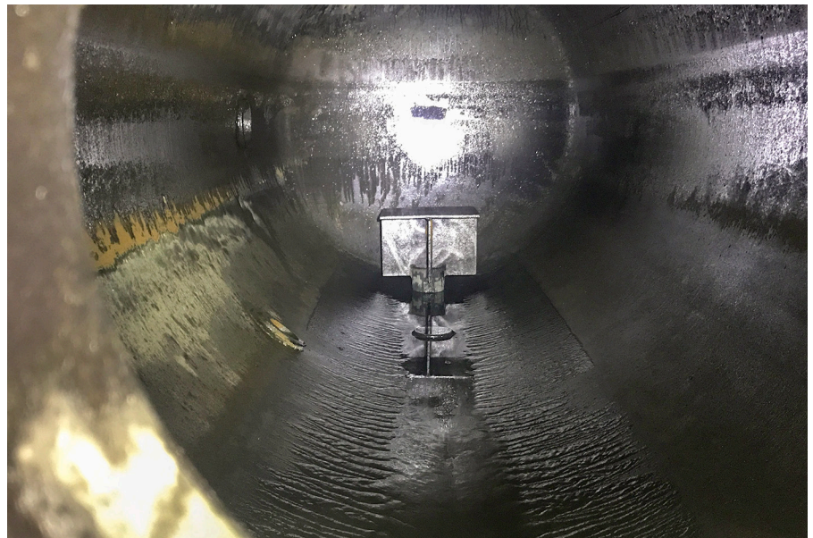
Fig. 3b. After a clean-out operation, all the sand is removed. Marks on the vessel walls indicate the typical oil, water and interface levels.

Using HART communications, these devices deliver the benefits of advanced smart diagnostics, providing greater insight into the condition of the device, and