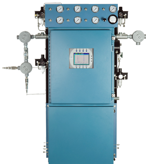
Figure 2. Emerson's Rosemount 1500XA process GC.

This fractionator acts like a miniature crude tower by separating the ‘cracked’ petroleum stream into various petroleum cuts, such as naphtha/gasoline, kerosene, etc. The heaviest fraction leaving the bottom of the main fractionator is typically recycled back to the feed stream for reprocessing. Exiting the overhead of the main fractionator is a gas vapour stream that is rich in olefin compounds. This stream is often sent to the VRU where the olefins are recovered for use in processes such as the alkylation unit.