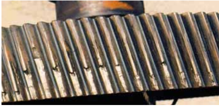
FIGURE 2. A failed gear can be detected through vibration analysis.