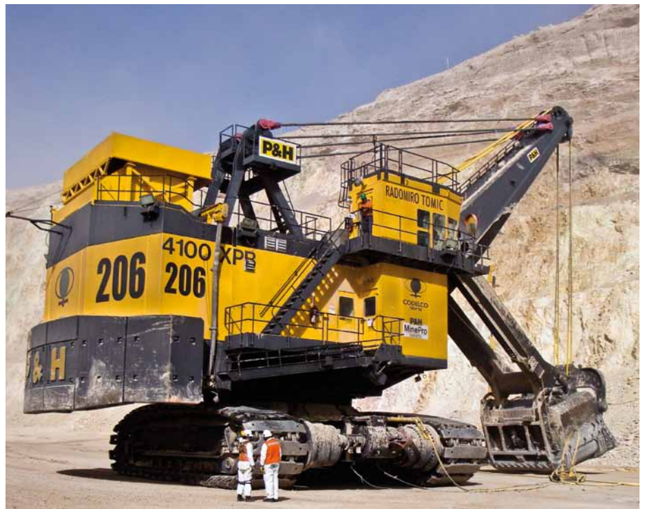
FIGURE 1. Electric rope shovels with capacities up to 100 tons are one of the most critical assets in open pit mines.

However, an electric rope shovel is not an easy application for vibration analysis. The shovels are variable-speed systems with short cycle times, complex gearing arrangements and high background vibration levels – not to mention that they tend to be located in some of the most remote places on the planet.