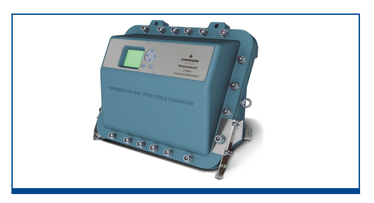
Rosemount CT5800 Continuous Gas Analyzer