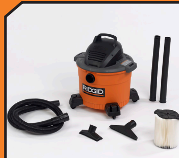
Vac with Accessories & Filter