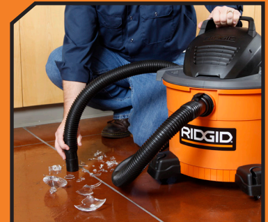
Dry Pick-up - Workshop, Garage etc.