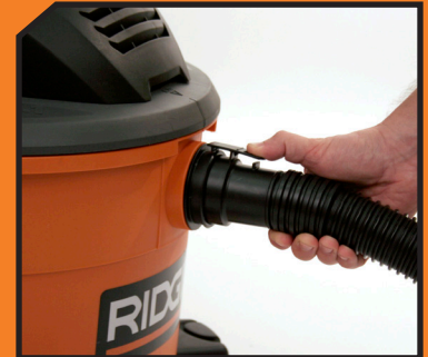
Tug-A-Long® Locking Hose