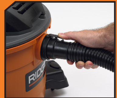
Tug-A-Long® Locking Hose