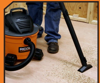
Dry Pick-up - Workshop, Garage etc.