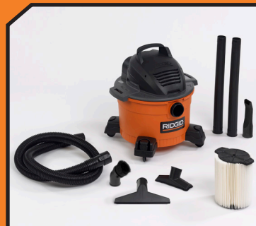
Vac with Accessories & Filter