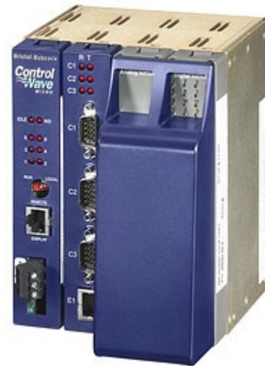
ControlWave Micro (4-slot)

Expansion units are constructed of aluminum and add an additional two, four, or eight-slot housing that attaches to the base unit. These additional slots may be used for I/O modules.