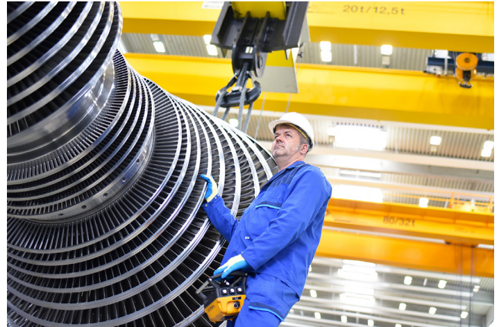
Maintenance of a Hydrogen-Cooled Generator