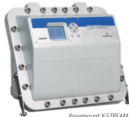
Rosemount X-STREAM Enhanced XEFD Continuous Gas Analyzer