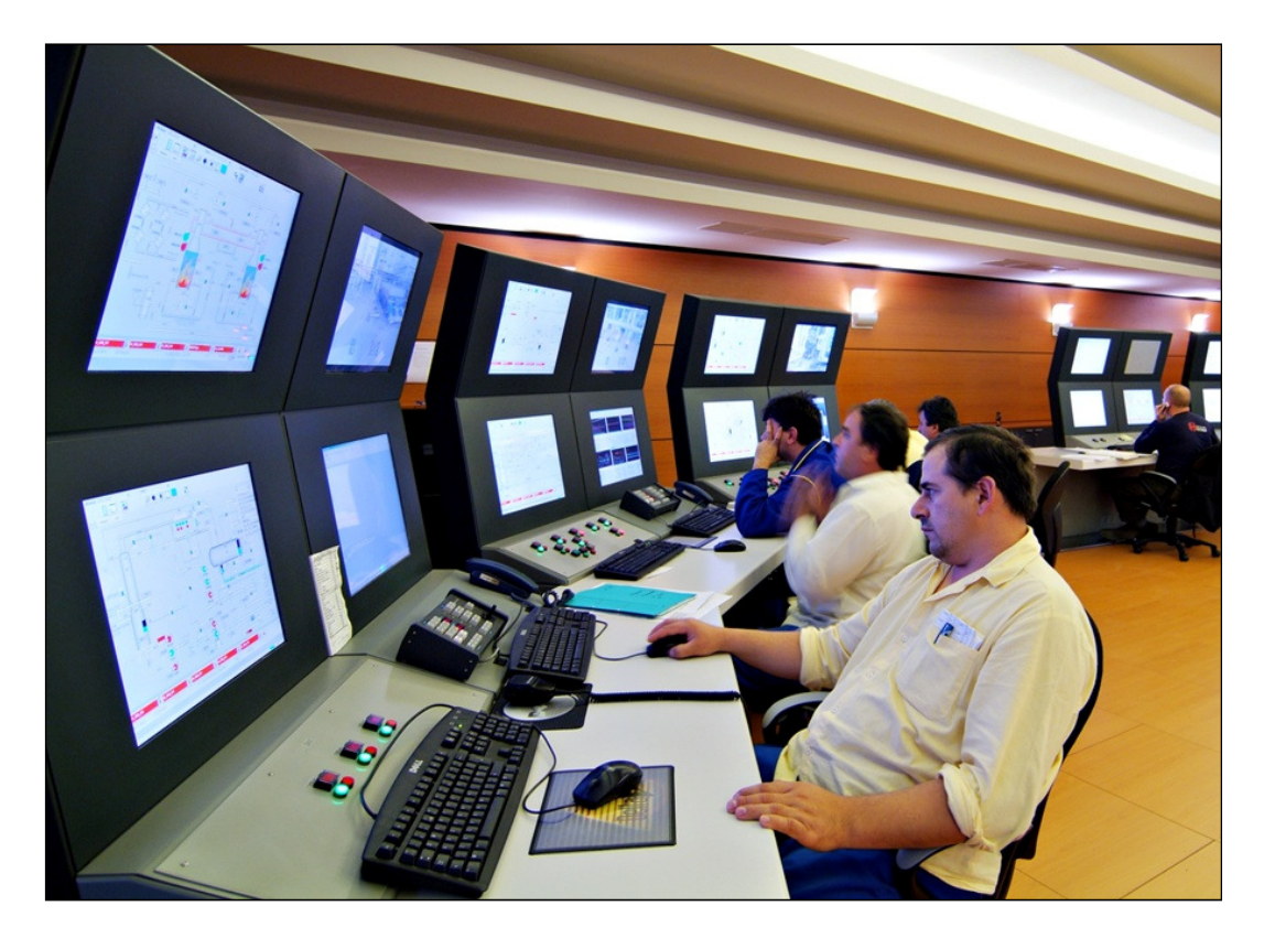
A Four-Monitor Workstation provides your operators additional screen "real estate" in order to view more information about process operations from a single workstation.