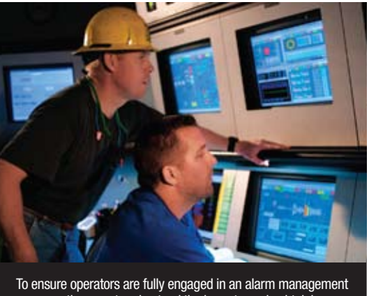
program, they must understand the importance in obtaining feedback from the alarms.

While enhancing safety is a key benefit of an effective alarm management strategy, other important advantages exist, as well. Alarm management plays a role in reducing operator fatigue and stress, thereby contributing to increased productivity and job satisfaction. At Pawnee Station, for example, time spent by operators to respond to and silence numerous alarms can be applied toward